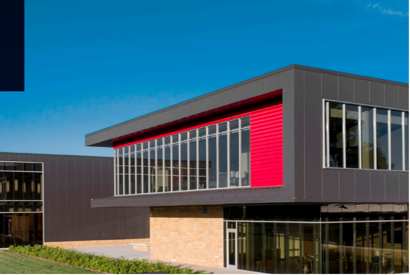
Hospitals and educational institutions

Wherever buildings or venues expect to see a large number of visitors, patients or workers, sandwich panels with stone wool provide increased safety, sound absorption, energy efficiency and sustainability. The building – and the assets and people within it – will directly benefit from the 7 Strengths of Stone, for decades to come. Here are just some examples of commercial, industrial and logistics buildings that benefit from sandwich panels made with ROCKWOOL stone wool at the core.