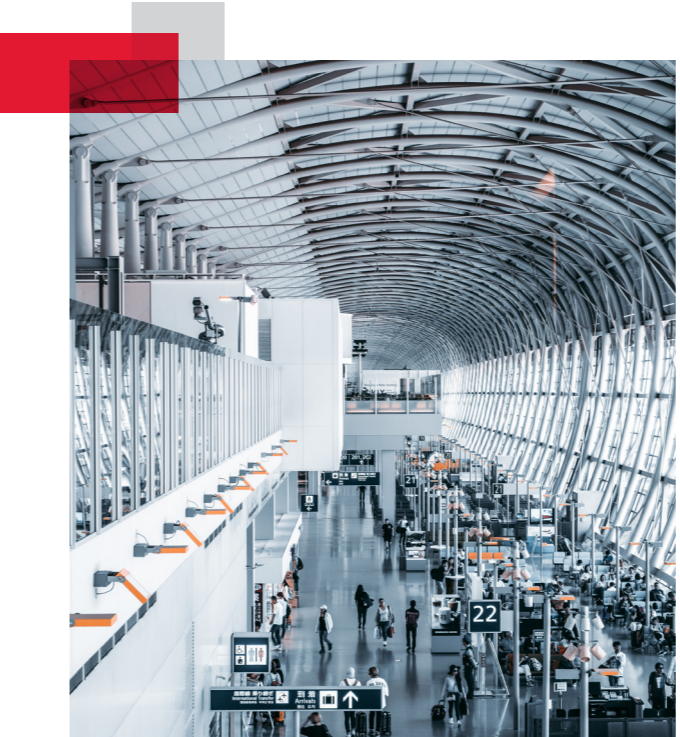
Airport terminals and maintenance hangers