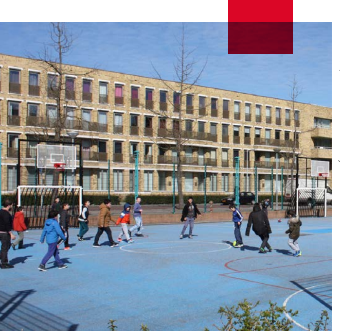
Kolenkitbuurt, Source: We Love The City