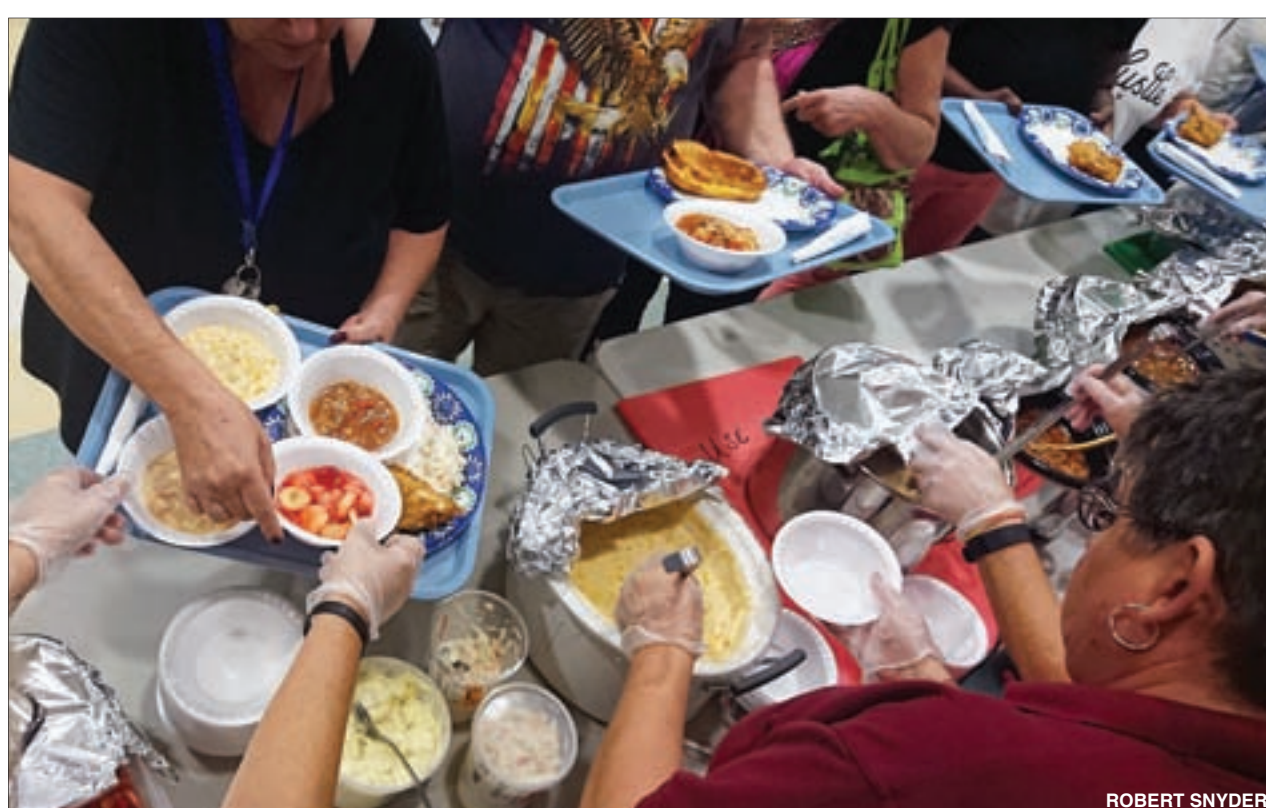
Volunteers serve a free dinner Monday to about 60 at Asbury United Methodist Church in Charles Town.