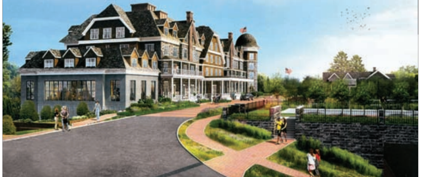
A deadline to get the town's approval for rights of way for the new Hill Top (shown in a SWaN rendering) comes on Thursday.